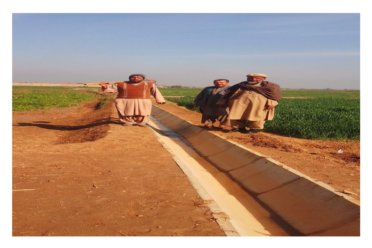
Figure 3: Field visit of Khyber Pakhtunkhwa during the month of February 2025