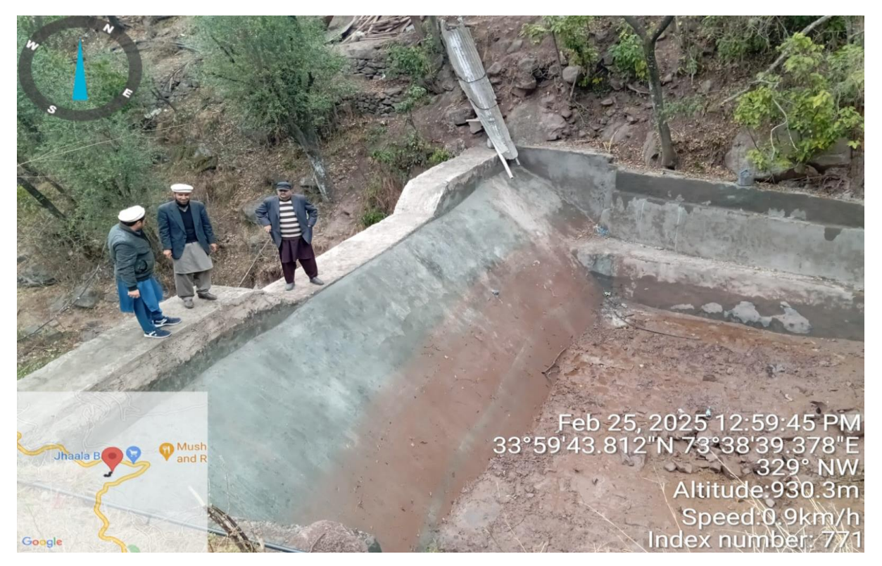
Figure 4: Field visit of Azad Jammu and Kashmir during the month of February 2025